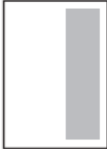
VERTICAL 1/2 PAGE AD