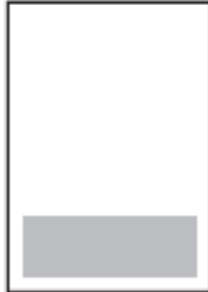
HORIZONTAL 1/4 PAGE AD