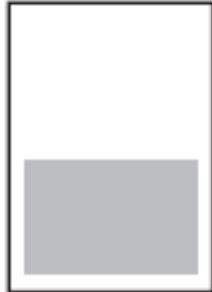
HORIZONTAL 1/2 PAGE AD